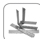
Clips & Brackets